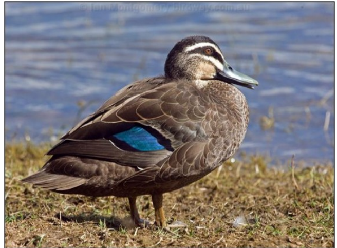
Pacific Black Duck.