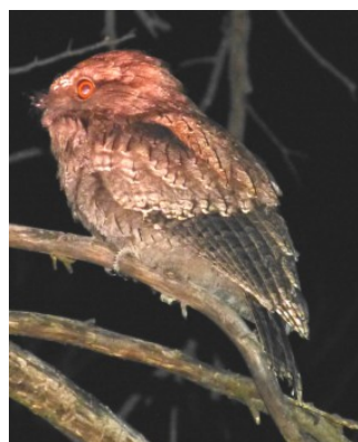
A young Tawny Frogmouth

About a dozen people joined us for a walk on the evening of Sat 9th Feb, including a few who hadn't previously visited Banyule flats and a baby. A Kookaburra was seen in the big old Eucalyptus studleyensis (Swamp gum and Red gum hybrid) near the Somerset drive carpark. We visited the swamp and saw Black ducks with ducklings and a number of Silver (Sea) Gulls. We then walked around the Banyule Billabong to the windmill and returned on a smaller track through the east paddock. A number of Ring-Tailed possums, three Tawny Frogmouths, and some rabbits were sighted. We visited a large wombat hole with evidence of recent digging, but the wombats either hiding or busy elsewhere.