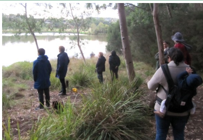
At the Banyule Swamp