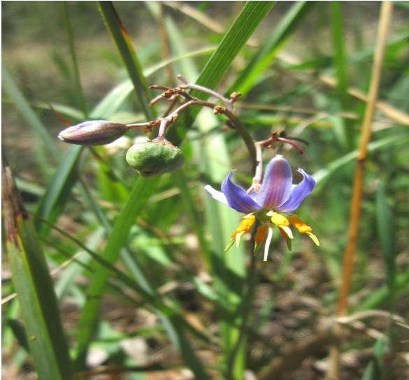
Matted Flax-Lily (endangered)