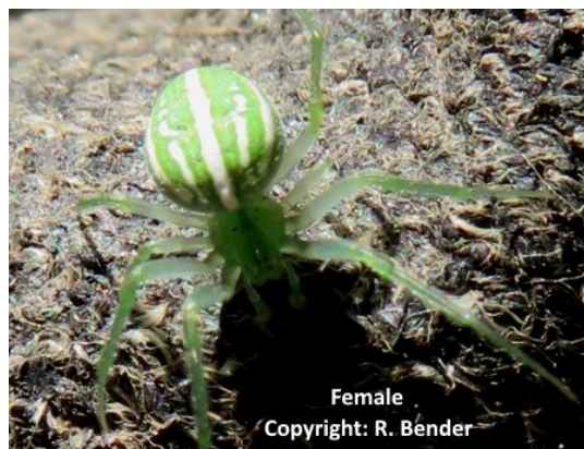
Female