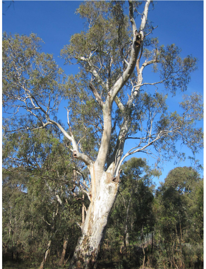
A Large River Redgum

Would you like to receive your newsletter by email rather than a paper copy in the regular mail Save paper and see the photos in colour. Contact us at warringal3084@gmail.com