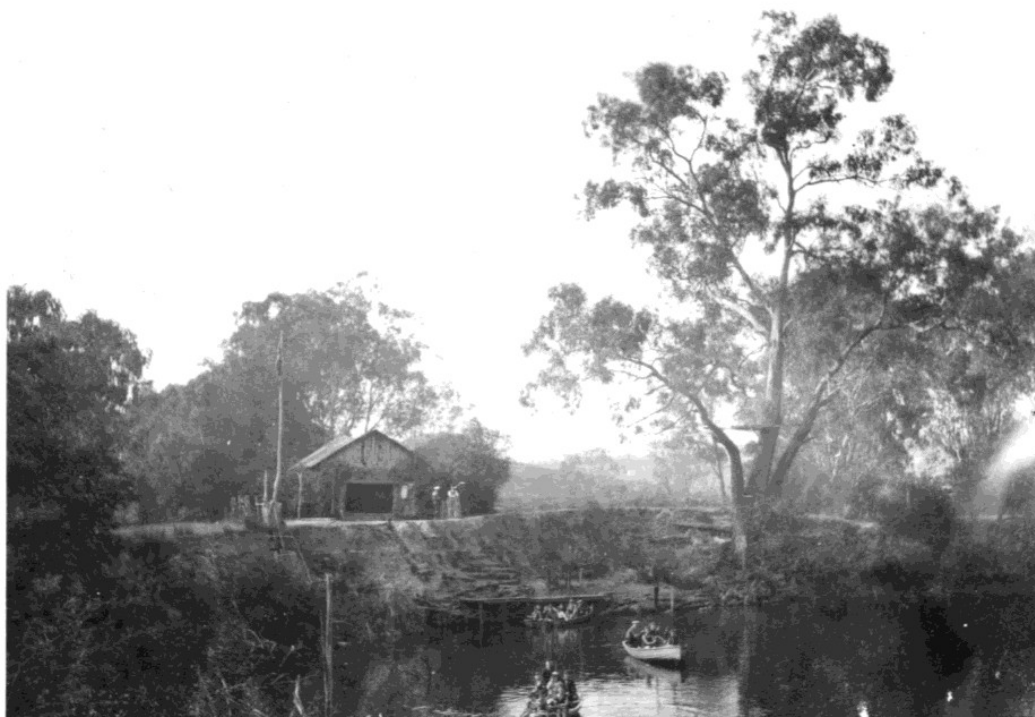
Left: The Manna Gum next to the Sea Scouts Den in 1932.