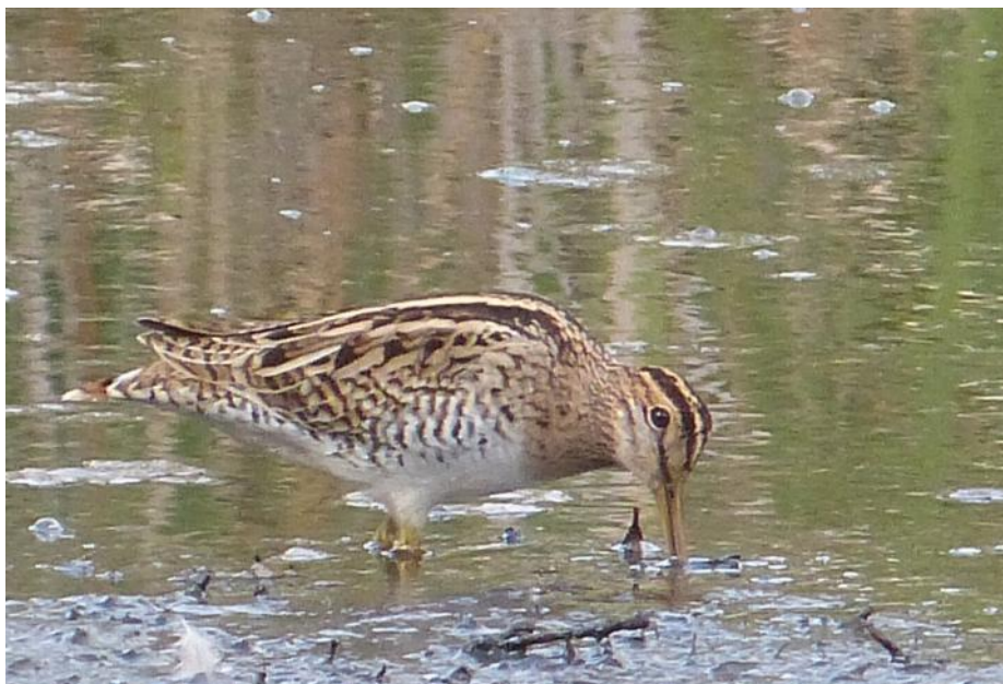
A Latham's Snipe feeding in the Grotty Pond at Banyule Flats - 5th March. Taking on fuel for the long flight home to northern Japan.

Would you like to receive your newsletter by email rather than a paper copy in the regular mail Save paper and see the photos in colour. Contact us at warringal3084@gmail.com